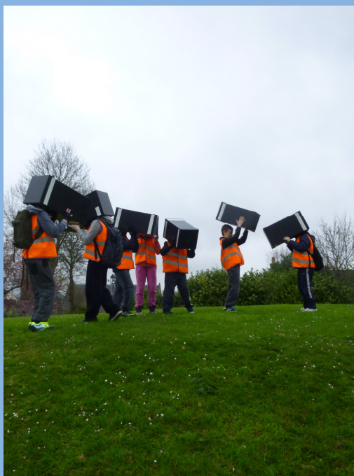
Camera Obscura in Peel Park

Hype that site - For Park and Stride Info www.livingstreets.org.uk